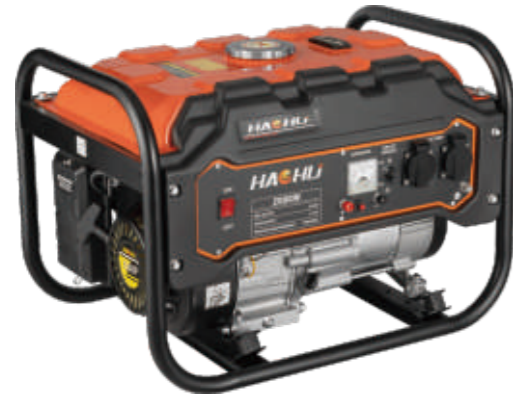
HT-2500N HT-3500N HT-6500N