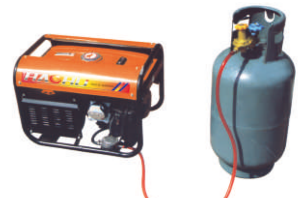
HT-2500M HT-3500M HT-6500M