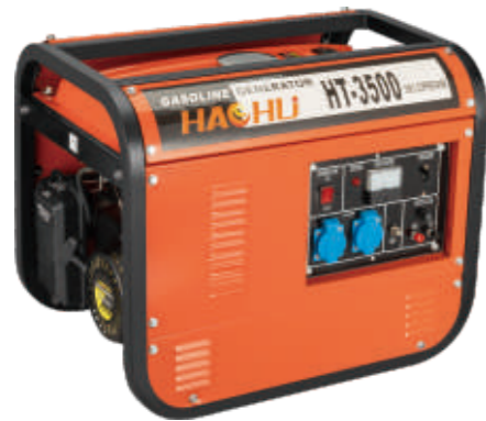
HT-2500Q HT-3500Q HT-6500Q