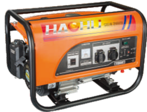
HT-2500F HT-3500F HT-6500F