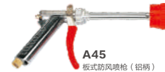
A45 板式防风喷枪(铝柄) Board type windbreak gun(alu. handle)