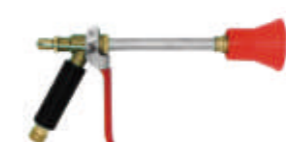
A41 意大利式喷雾枪 Italienische spritzpistole