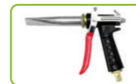
Foam washing gun