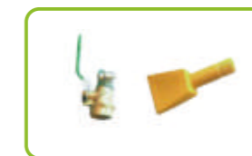
Inlet valve Nozzle