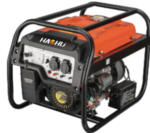
HT-2500T HT-3500T HT-6500T