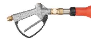
A40 意大利手枪式喷枪 Italy pistol lance