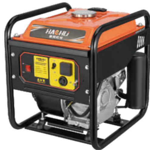
HT-F2800D HT-F3500D HT-F4000D