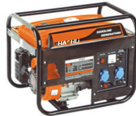
HT-2500J HT-3500J HT-6500J