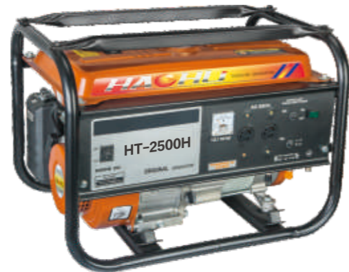
HT-2500H HT-3500H HT-6500H