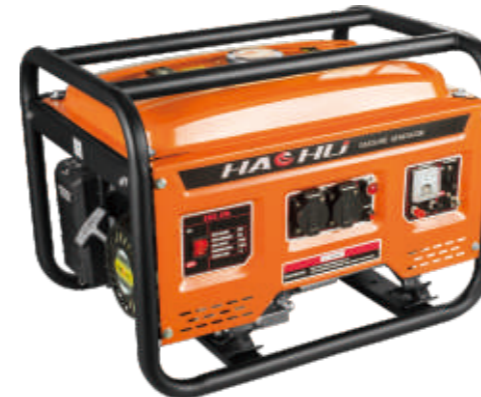
HT-2500C HT-3500C HT-6500C