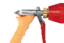
A39 手枪式喷枪 pistol lance