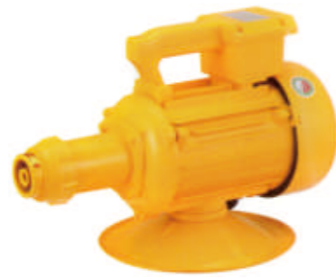
Japanese Type with clamp