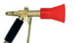
A43 意大利式喷雾枪(短) Italienische spritzpistole (short)