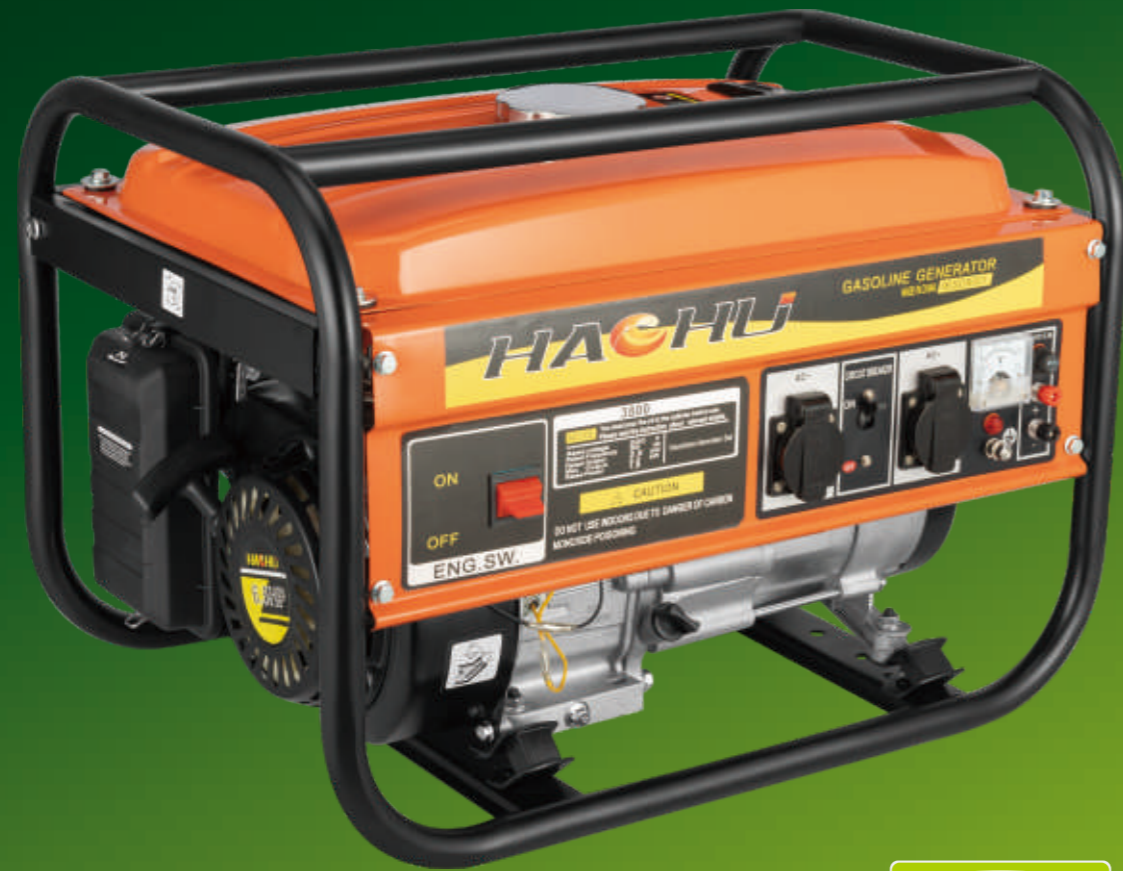
HT-2500 HT-3500 HT-6500

► ENTERPRISING AND INNOVATING AS EVER CE ISO9001