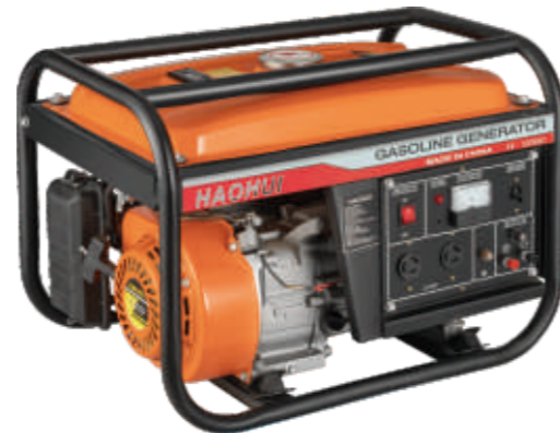
HT-2500R HT-3500R HT-6500R