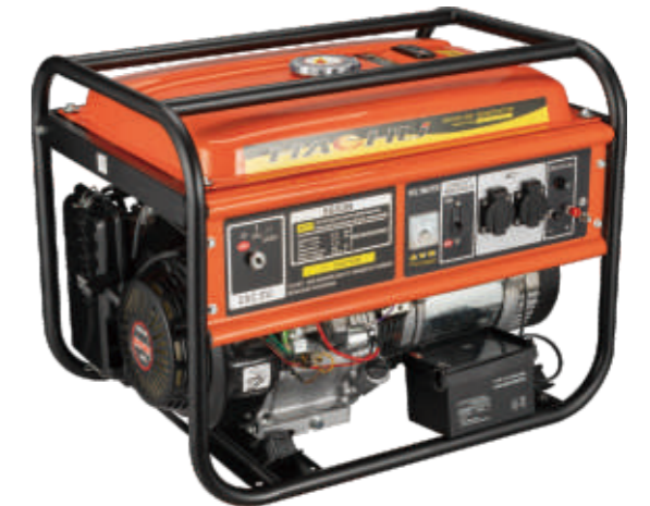
HT-5500 HT-6500 HT-7500