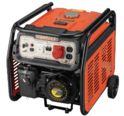
HT-2500W HT-3500W HT-6500W