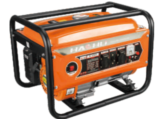
HT-2500D HT-3500D HT-6500D