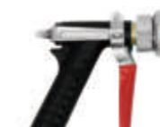
A42 台湾短枪 Taiwan short gun