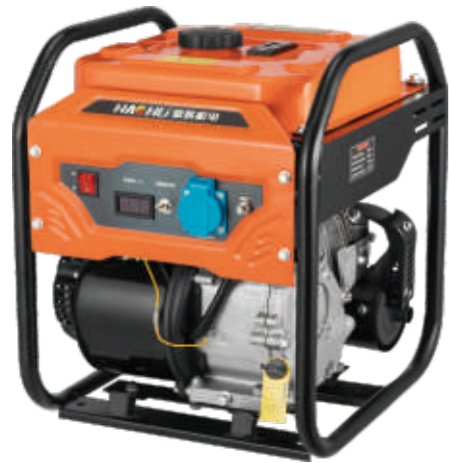
HT-F2800C HT-F3500C HT-F4000C