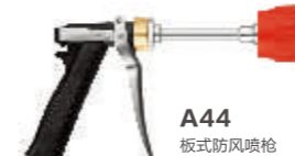
A44 板式防风喷枪 Board type windbreak gun