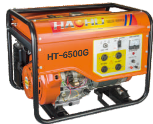
HT-2500G HT-3500G HT-6500G