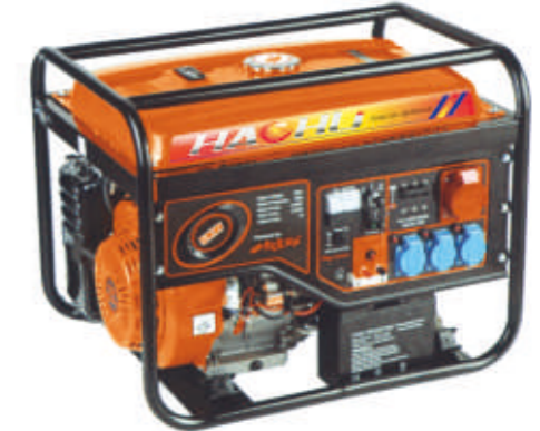
HT-2500K HT-3500K HT-6500K