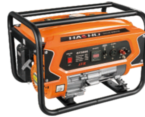
HT-2500A HT-3500A HT-6500A