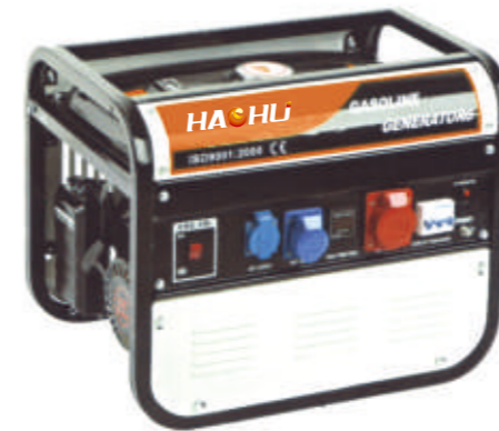
HT-2500L HT-3500L HT-6500L