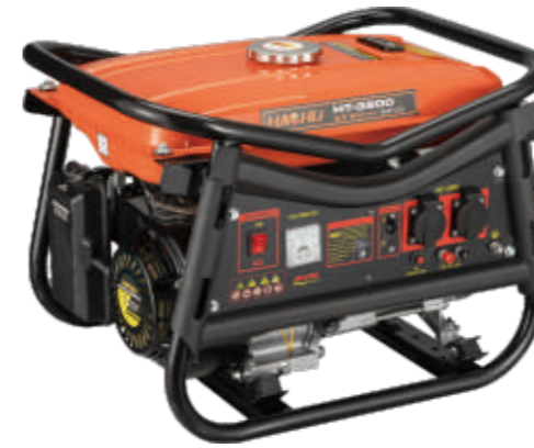
HT-2500S HT-3500S HT-6500S