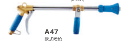
A47 欧式喷枪 Europe style spray gun