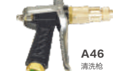
A46 清洗枪 Cleaning gun