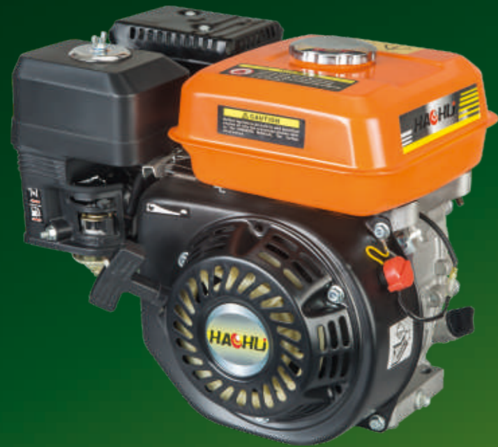
HT-168F / HT-168F-1

ENTERPRISING AND INNOVATING AS EVER CE ISO9001