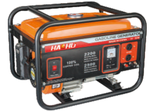
HT-2500B HT-3500B HT-6500B