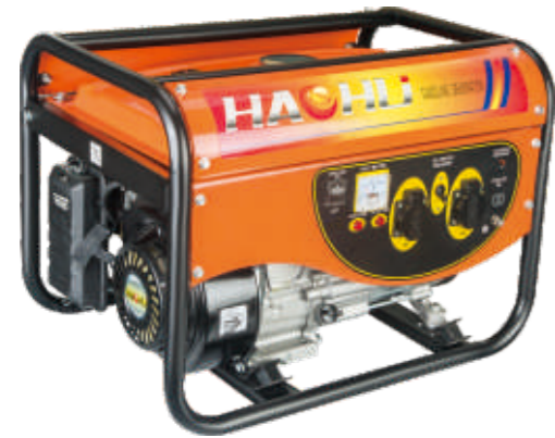
HT-2500E HT-3500E HT-6500E